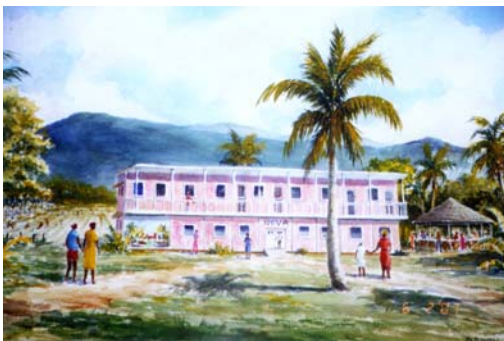
Proposed NOVA Medical Clinic in Haiti